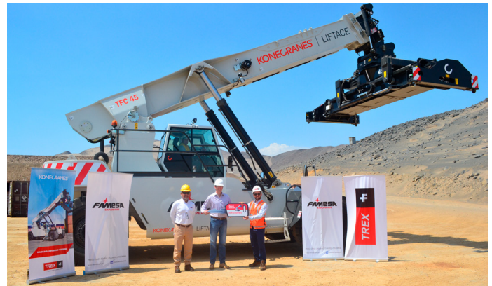
Trex team hands over the keys to Famesa Management after delivery and commissioning of the Konecranes Liftace reach stacker model TFC 45

cvaldez@famesa.com.pe - www.famesa.com.pe