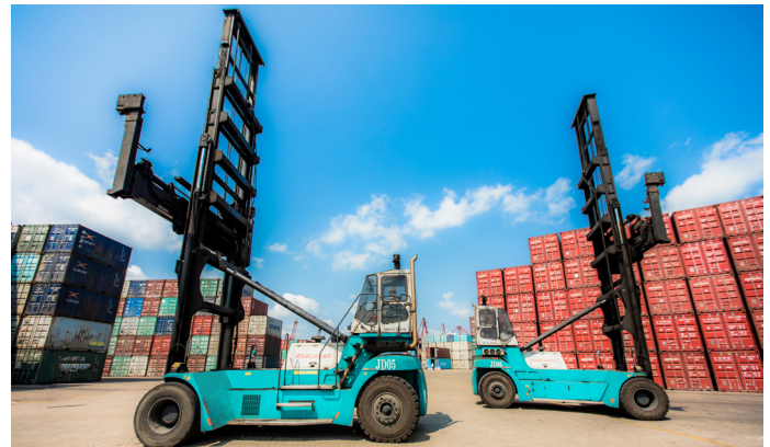
Konecranes empty container handler units working side by side at Haikou Port Container Terminal Co. Ltd, China.